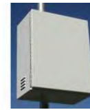
Batteries, Enclosures, and More!