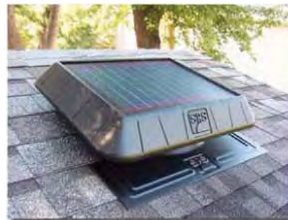
Solar Attic Fans

The energy efficient and environmentally friendly way to cool and protect your attic and roof.