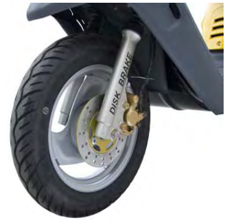
Front Disk Brakes

Bravo's EVT-4000e Scooters are DOT compliant and fully intended to be driven on public roads.