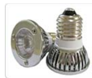
E27-3W LED Spot Light Bulb