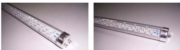
LED T-8 Tubes