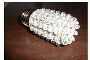
LED 360 Degree