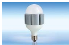
LED SP80 - 10W (Equal to 75w Incandescent Bulb)