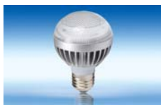
LED SP70 - 5W (Equal to 40w Incandescent Bulb)