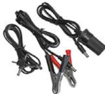
Adaptor cables that come with Solaris